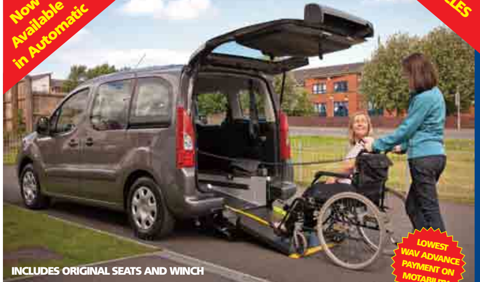
INCLUDES ORIGINAL SEATS AND WINCH

LOWEST WAV ADVANCE PAYMENT ON MOTABILITY